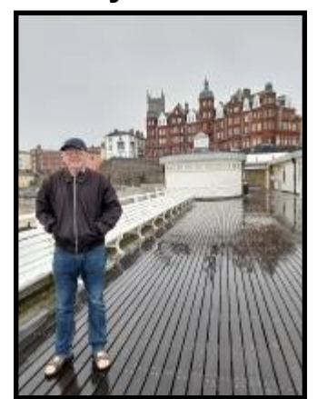
Cromer in the rain