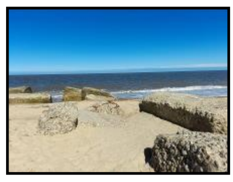
Sea defences at Winterton-on-Sea

On a walk from Walcott to Bacton, we found this very rare World War II bullet-proof section post, dating from 1940. It is one of only two in Norfolk. It was disguise as a haystack.