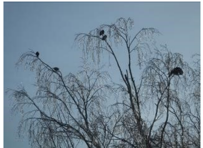
Frost hanging like jewels from Babs