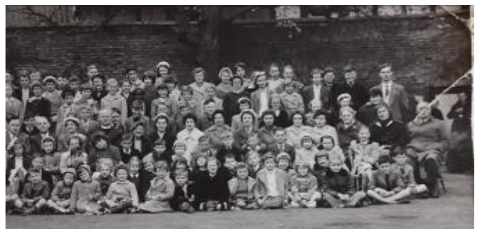
Anyone recognise anyone else?