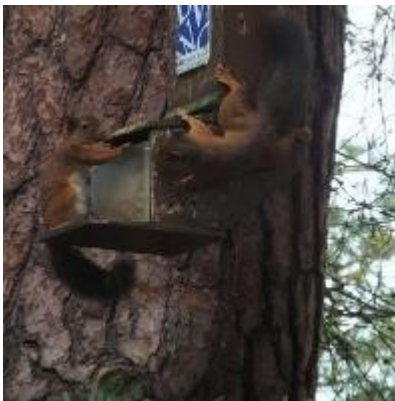
(Ed: yes, it is Scotland not the Seychelles!)