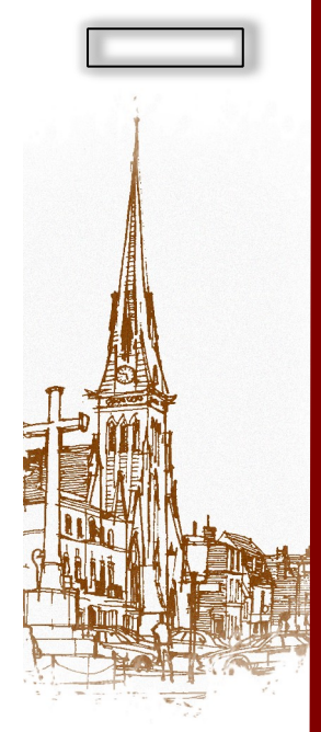
THE NEWSLETTER OF THE FREE CHURCH (UNITED REFORMED) SAINT IVES