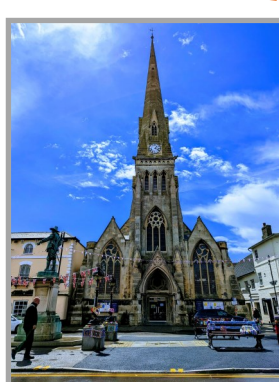
Photo taken by Sarah Bateman during the Platinum Jubilee celebrations