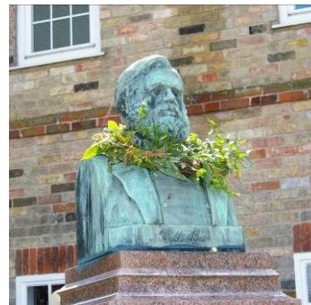
Potto Brown Memorial at Houghton